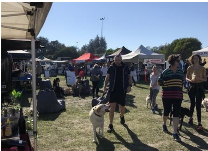
Farmers Market – Saturday 15th June