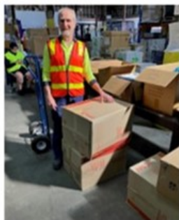
Uniforms at DIK Store

With the renaming of Berendale School to Hampton East School, surplus named Berendale School uniforms had to be disposed of. The Club collected 10 boxes of stock and delivered them to our DIK (Donations-In-Kind) warehouse in West Footscray. From there, the uniforms will be sent to schools in Timor L'este where students have an urgent need of any uniforms. An incorrect name is not important.