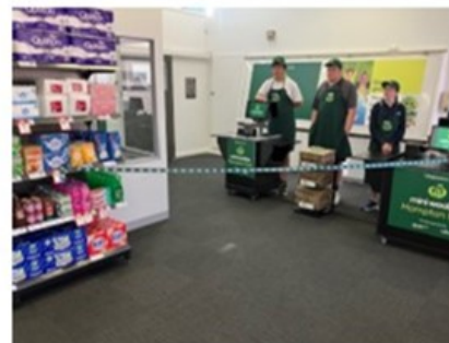
Mini Woollies Store